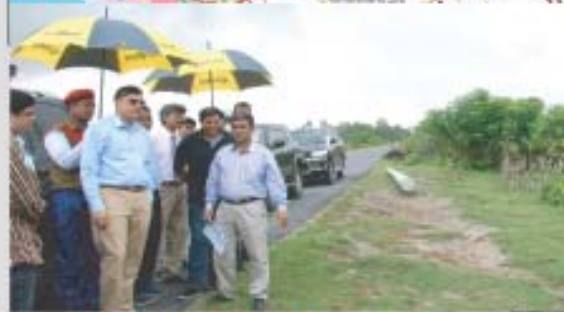
BEPZA Chief observed the Mirsarai Economic Zone site