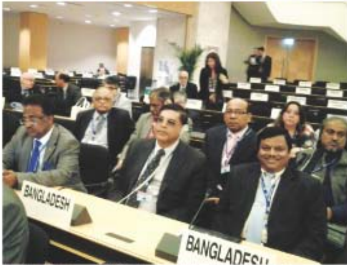
Executive Chairman of BEPZA participates in International Labour Conference, Geneva