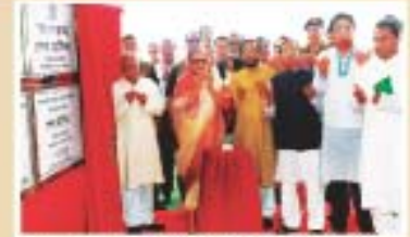
The Honourable Prime Minister inaugurates Central Effluent Treatment Plant in Comilla EPZ