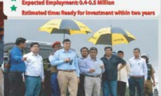
BEPZA Chief physically examine the EZ site