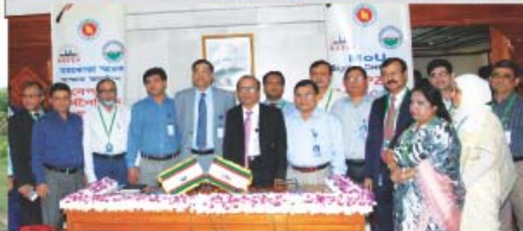
The Executive Chairman of BEPZA and BEZA along with other officials from both side pose after MoU signing