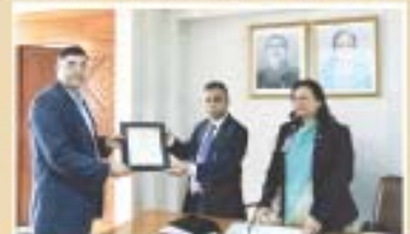
Principal Secretary, PMO giving Honouring Certificate to BEPZA Chief for accomplishing the KPI targets