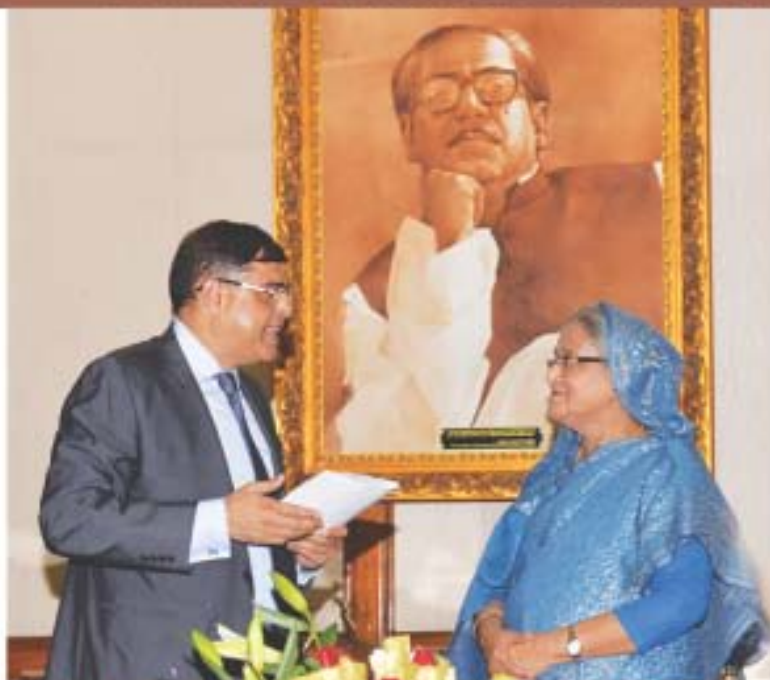
BEPZA Chief handing over cheque on behalf of investors to the Honourable Prime Minister