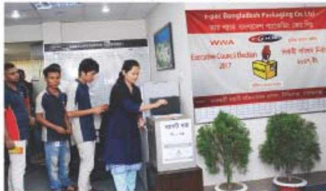
Workers dropping ballot paper in the ballot box in r-Pac Bangladesh

Adnan PSF, Fujian Export & Gold Shine Industries: Referendum took place in three factories of Ishwardi EPZ in order to form WWA. Bangladeshi owned M/s Adnan PSF Industries Limited & M/s Fujian Export Industry Limited arranged referendum on May 22 and Indian owned M/s Gold Shine Industries on May 29. The eligible workers of these three factories voted 'yes/no' through secret ballot where 100% workers of Adnan PSF Industries, 78.58% of Fujian Export Industry and 86.47% of Gold Shine Industries voted against formation of WWA; as a result, no further referendum shall be held in these factories until expiration of one year.