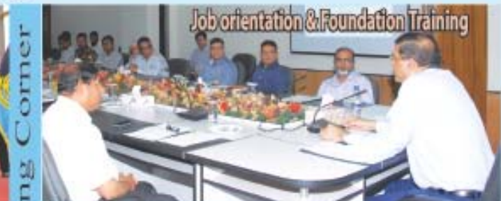
Job orientation & Foundation Training