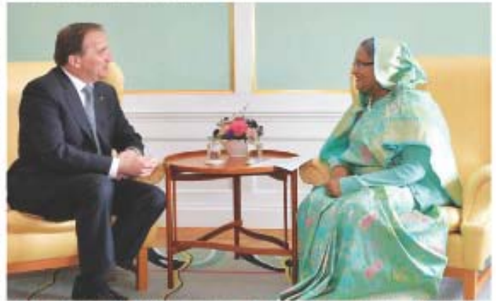
Prime Minister Sheikh Hasina meets with Swedish Prime Minister Stefan Lofven

The Prime Minister expressed firm belief that her visit to Austria would infuse a new dynamism into the bilateral relations between Dhaka and Vienna. "I firmly believe that my visit to Austria would add dynamism to our relations," she said. The Austrian Chancellor mentioned that the first official visit of a Bangladesh Premier to Austria unveiled a new horizon in the bilateral ties between Dhaka and Vienna.