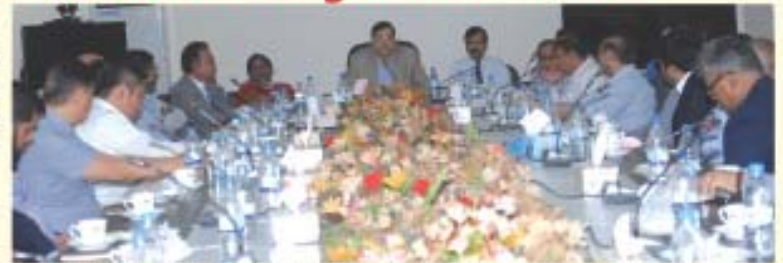
BEPZA Chief and investors discussing on working atmosphere in a seminar