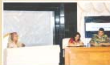
Secretary, PMO & Executive Chairman, BEPZA sign APA in presence of the Honourable Prime Minister