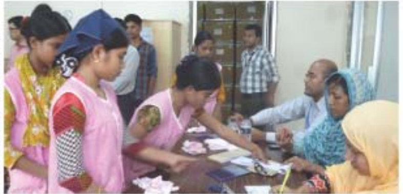
Workers putting thumb impression to collect ballot during referendum in Ocean Apparels