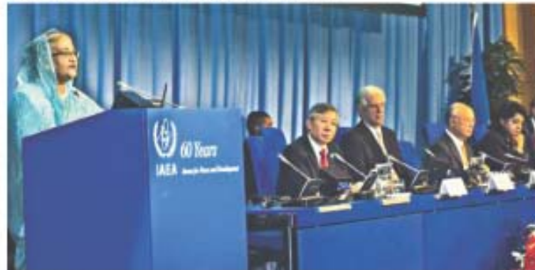
Prime Minister Sheikh Hasina addressing at the IAEA conference in Vienna, Austria