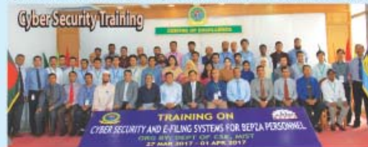
Cyber Security Training

BEPZA achieved training target set in the Annual Performance Agreement (APA) of FY 2016-17 like previous year. As per the APA of FY 2016-17, 20 Man-Hour training was fixed on APA and SDG, 10 Man-Hour on Cyber Security & e-filing and 40 Man-Hour on other official training. Round the year BEPZA organizes training program for its employees to keep them up-to-date so that they can provide better services to the investors.