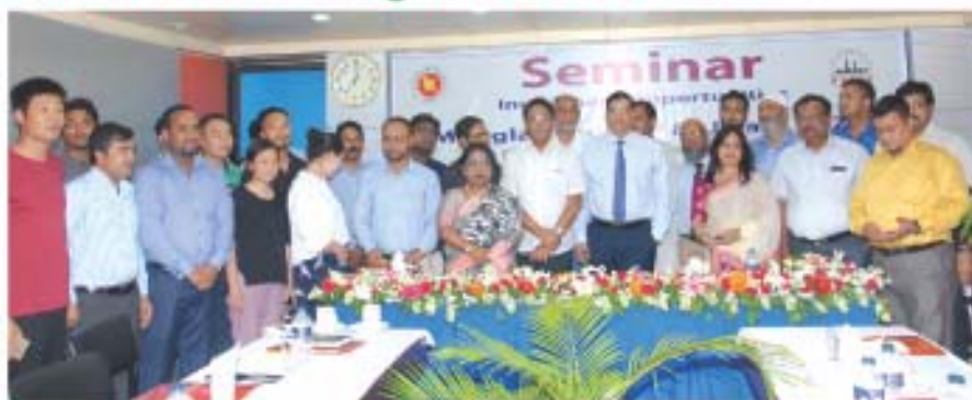
BEPZA Executive Chairman poses along with the participants after ending the seminar