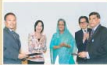
BEPZA-JETRO sign MoU in presence of the Honourable Prime Minister Sheikh Hasina