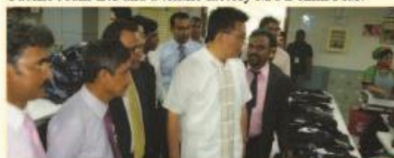
A Team of Chinese Communist Party tour around Pacific Jeans Ltd in CEPZ

The 6-member delegation went around a garments plant M/s Pacific Jeans Ltd and a textile factory M/s Denim Plus.