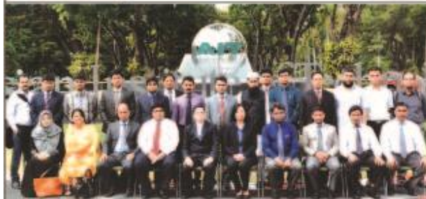
20 Officers of BEPZA Trained on ERP & IT Application from AIT, Thailand in June, 2015