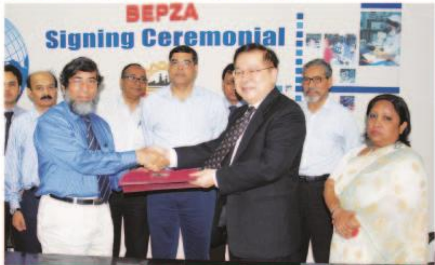
Member (Investment Promotion) and M/s Masters Leather exchange documents after inked the deal in presence of BEPZA Chief