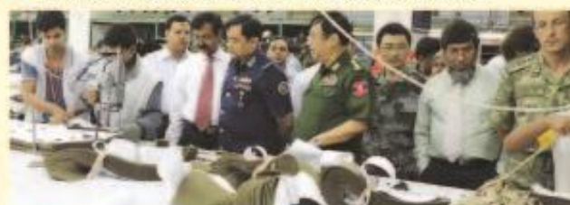
DGFI delegation visited Tigerco limited RMG factory/Tigerco Ltd. in Dhaka EPZ

As a part of this visit, 16 members DGFI delegation went around a RMG factory M/s Tigerco Ltd. and a plastic product manufacturing company M/s Young Optics (BD) Ltd.