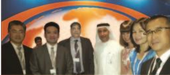
Key business leaders and international business delegates at WFZO Conference in Dubai