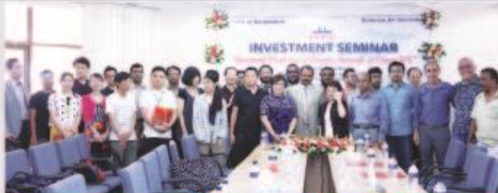
Investment Promotion Seminar for 3 EPZs organized in Comilla EPZ on 10 May, 2015