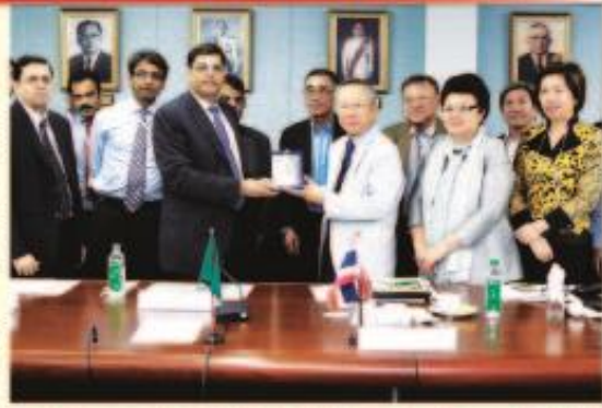
BEPZA Chairman's presentation to President of Thai Chamber of Commerce (TCC & BTT)