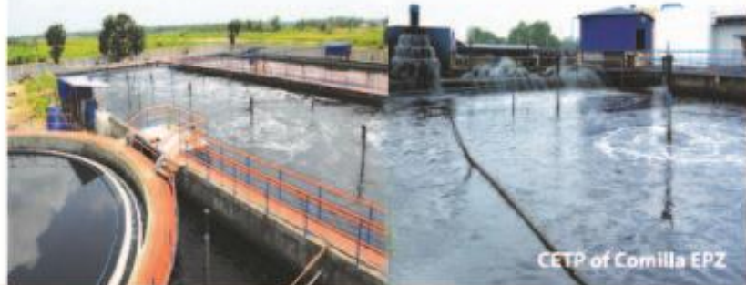
CETP of Comilla EPZ

Under direct supervision of the Prime Minister BEPZA is now one of the most successful organizations of the country.