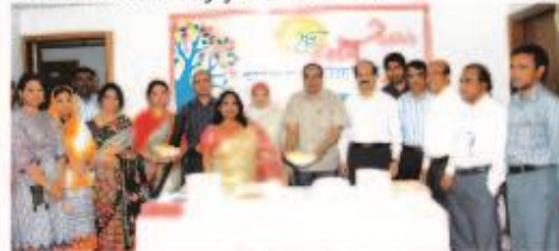
BEPZA employees celebrated Pohela Boishakh in a colourful festive manner

In this regard, BEPZA family enjoyed lots in the occasion of 'Pohela Boishakh 1422' at Executive Office, Dhaka. BEPZA employees celebrated this day through assemblage traditional food fiesta. As well as, all EPZs also officially celebrated this colourful festival in a joyful environment.