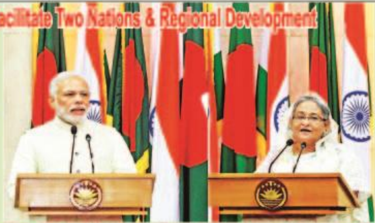
Prime Minister Narendra Modi (left) and Prime Minister of Bangladesh Sheikh Hasina (right) at a joint Press Conference at PMO

In a joint press conference at PMO Indian PM said, 'This visit would strengthen the bond between the two nations and benefit the people of the two countries as well as of the region.' Thus, the day began setting up the stage for inking 22 deals to boost economic growth, connectivity and security cooperation. Top leaders of the two countries translated their goodwill in actions by signing a host of treaties and agreements to pave the way for regional connectivity, economic development and increasing people-to-people contact. After signing the deals Mr. Narendra Modi said, 'Connectivity by road, rail, rivers, sea, transmission lines, petroleum pipelines and digital links will increase.' Sheikh Hasina mentioned that connectivity across the region would reduce inequality and maximise welfare gains.